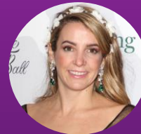
Tessy von Nassau