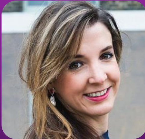
Tessy von Nassau, Standing up for the planet